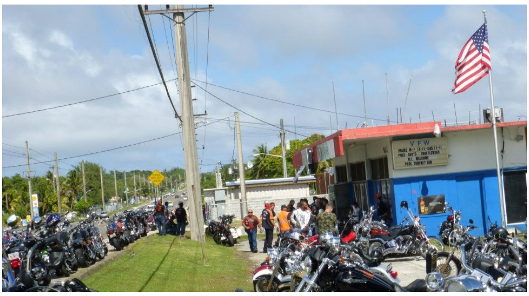
Dec 2012: Wounded Warrior Ride Around the Island; at VFW Post 1509 for BBQ