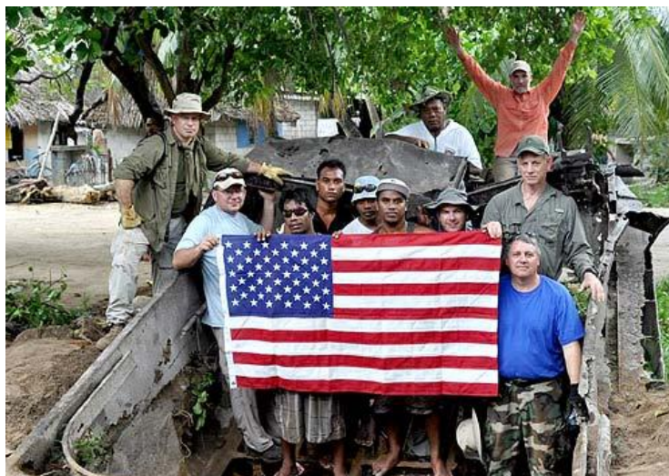
One of the 2013 Tarawa teams.